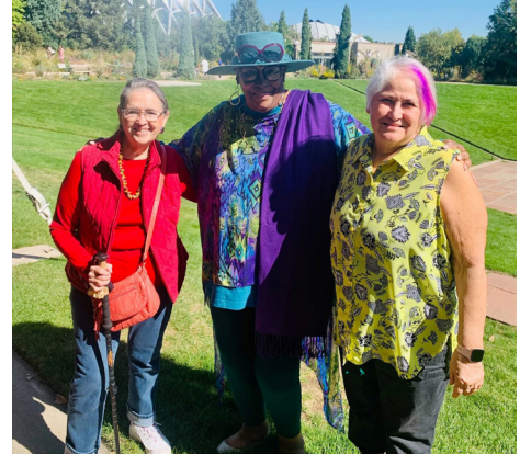
Group Photo at Senior Wellness Day