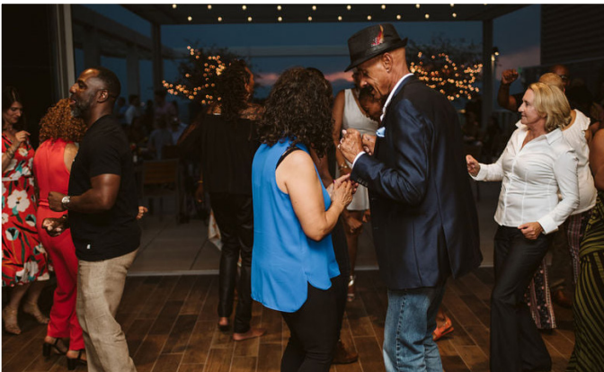
Dancing the night away at the Annual Old-School Fundraiser