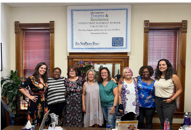
Wellness Initiative for Seniors Program