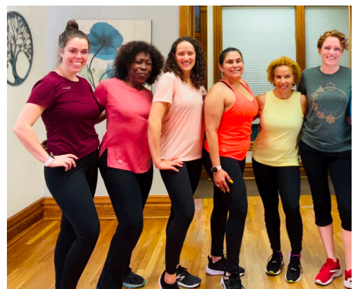
Zumba at CTR