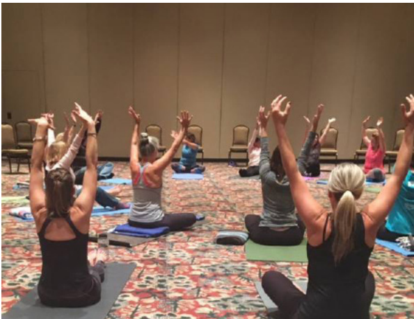
Staff hosting a yoga session at the annual COVA conference

Our heartfelt thanks to all who invested in the mission of The Center for Trauma & Resilience during 2018.